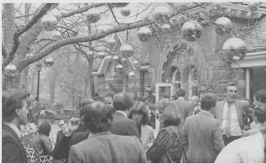
Memorex recently unveiled five new computer peripherals at a press conference in New York City which represented the largest number of products the company has introduced at one time.