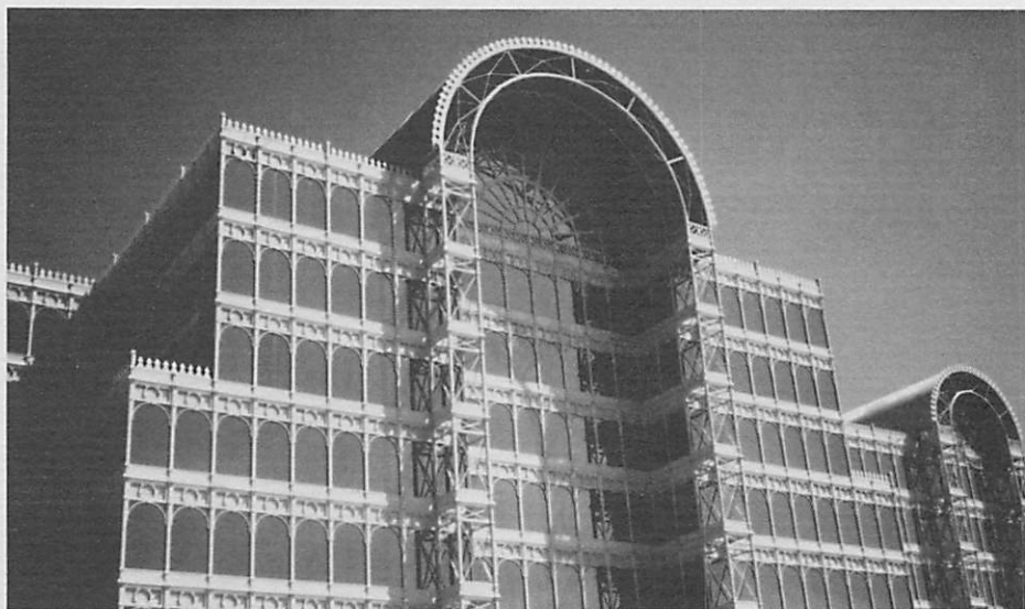
Memorex and Burroughs are displaying computer products in a joint suite at INFOMART, a seven-story "supermarket" for computer-related products in Dallas.